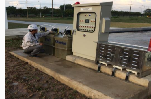
Chemical station checking