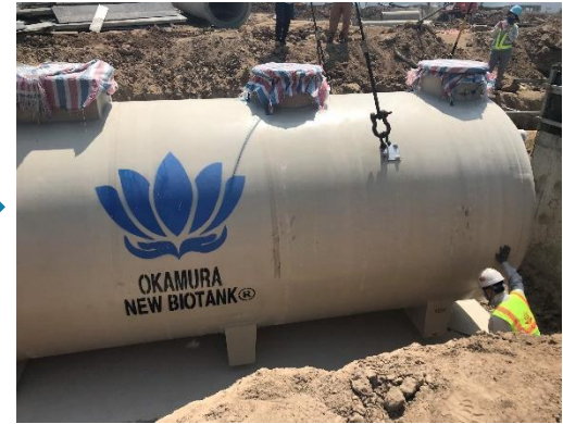
Unloading tank to prepared foundation