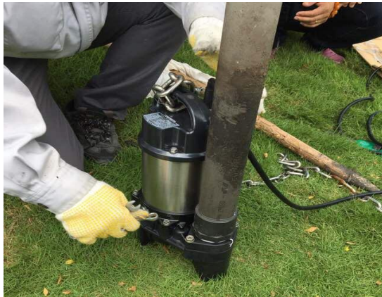
Discharge pump checking