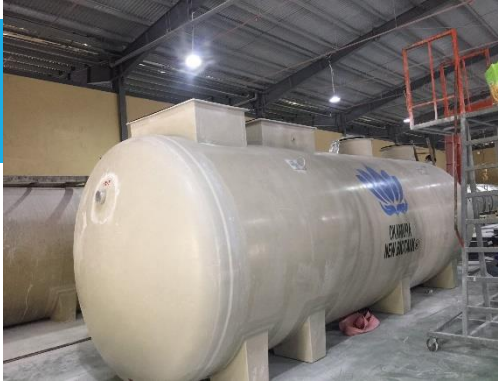
Tank fabrication at factory