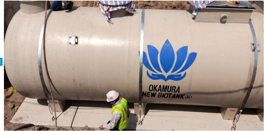
Tank fixing by anti floating belts