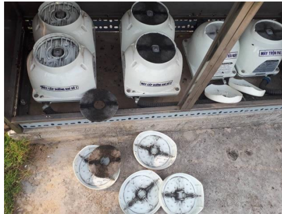
Air blower checking