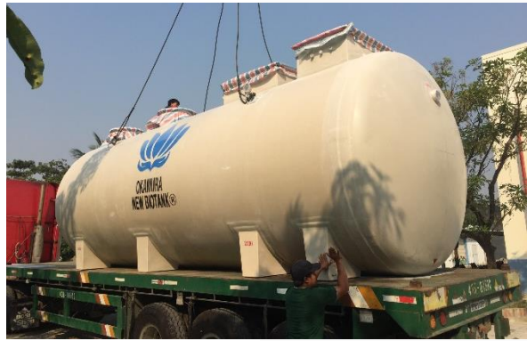
Tank pick up from factory