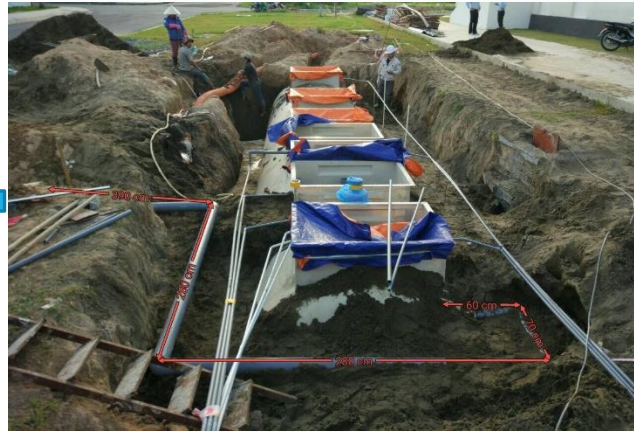
During installation (piping, control panel station, wiring, etc.)