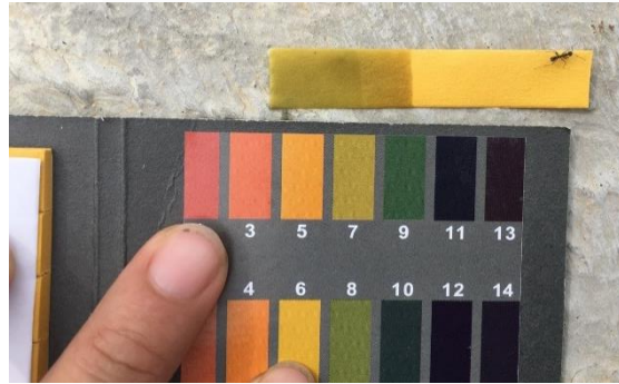
Onsite measurement (pH)